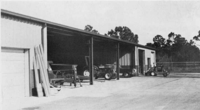
Rear view, maintenance building — Piper's Landing.