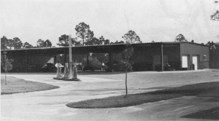
Front view, maintenance building — Piper's Landing.

Flexibility, efficiency, and attractiveness are all desirable elements that we would like to see incorporated into today's maintenance complex. The complex found at Piper's Landing provides these essential elements and has paid off, resulting in a smooth operation. ■