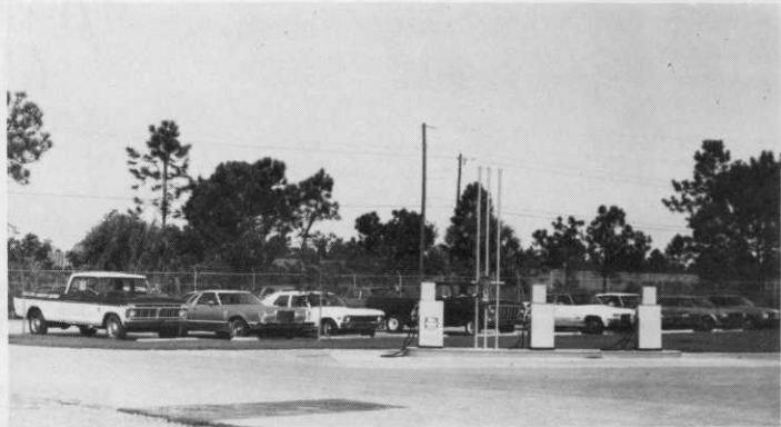
Employee parking located at the entrance to the complex.