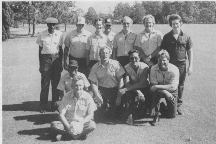
Grounds crew at San Jose Country Club.

"Experience, that's my strong point," he says. "I guess I've done a little of everything in my profession. Most of all, I really enjoy it. It's fun, and it's satisfying."