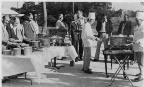
Appetites were hearty for the steak cookout.