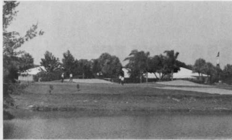
The First Annual Treasure Coast G.C.S.A. Golf Tournament was held over the demanding Turtle Creek Course.