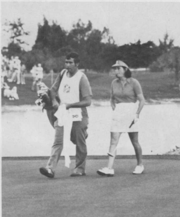
Amy Alcott walks up to green #18 enroute to first victory of the 1979 LPGA Tour.

Victory came as Amy Alcott watched her 25-foot birdie putt sink on the third sudden death playoff hole. She beat Sandra Post and claimed the $15,000. first prize. This brings her tournament wins up to six. Both Post and Alcott finished regulation play with one-over-par 73s and 72 hole totals of 213. Tied for third at an even 216 were Pat Bradley and Jan Stephenson.