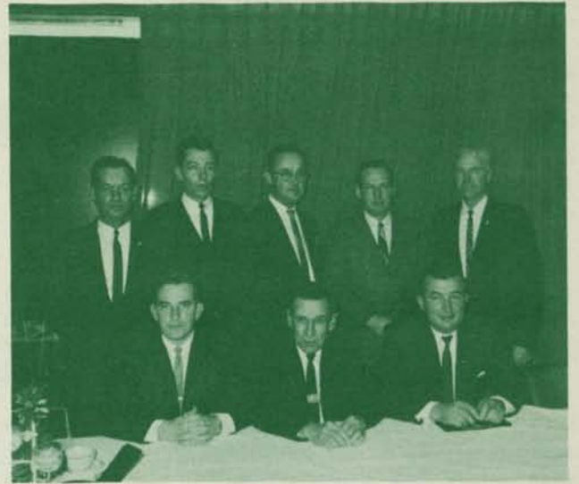
The new Officers and Directors for the year 1967.