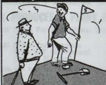
"Can't stop now, I have to get the cup in before this Fertil-Ade green closes the hole."