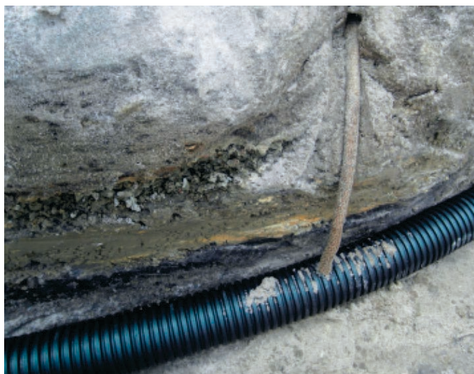
The discharge end of the PC Drainage is hooked up into existing or new conventional drain lines.

Dan plans to push the envelope even further this year overlaying the PC system on top of an existing an XGD system (more traditional - gravitational based drainage system) in hopes of enhancing drainage from his pushup green.