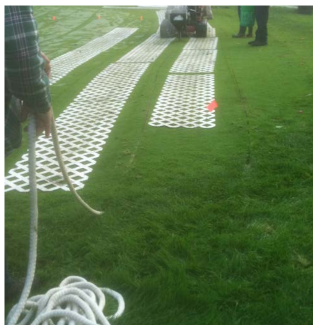
A vibratory plow is used to install the drainage element into the soil with minimal disruption to the surface.