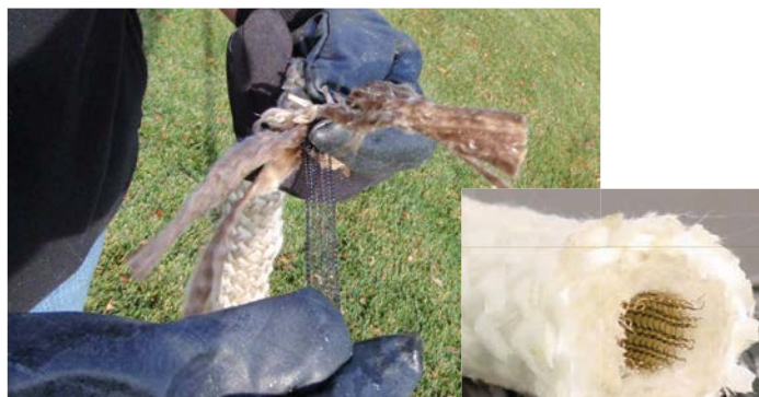
The PC element is a stainless steel mesh tube shrouded by woven fiberglass.

to which capillary action will take water in a uniform circular tube is limited by surface tension and, of course, gravity. That's when water is moving upward in a column or if you remember from plant physiology the movement of water and nutrients upward in plant tissue.