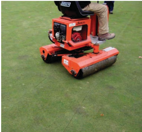
A little rolling over the slits from the plow and the area is ready for play.

the green to complete the system. After having an outside contractor (Hollembeak Construction) install the drainage component in the green or approach most clubs completed the hook up to existing tile in-house.