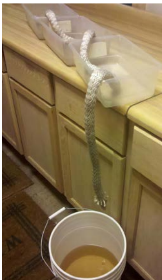
Capillary action at work – water is drawn from the tubs of water on the counter up and over each tub and eventually ends up in the bucket on the ground because the adhesive properties of water.

Capillary action is important for moving water on earth. It is defined as the movement of water within the spaces of a porous material due to the forces of adhesion, cohesion, and surface tension. (water.usgs.gov)