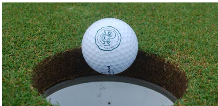
The Country Club of Peoria is one of the jewels of Central Illinois golf.

tions including new irrigation, regrassing greens, bunker renovations and releveled tee boxes.