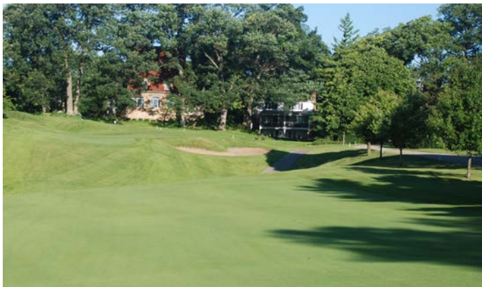
The historic Country Club of Peoria sits atop the Illinois River using the natural elevation and undulations to test one's golf skill. Pictured above and right.