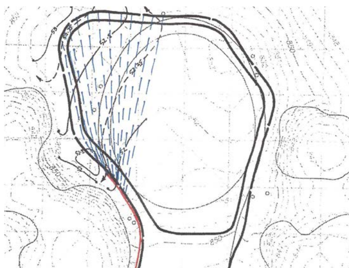
This is a drawing from North Shore's 13th green that shows the PC element (blue lines) and where it will connect to the existing drainline (red line).

Mark does see a difference in the amount of water these