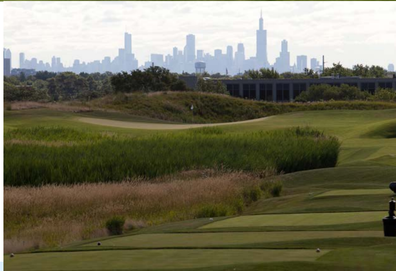
Image Below: The third hole in the foreground and the 8th in the background uses native plantings to separate playing areas and keep the vistas open and spacious.

Image right: One of the most recognizable skylines in the world can be seen from several points on the property.