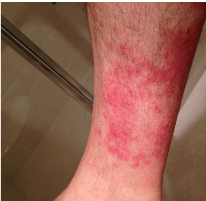
Golfer's Vasculitis starts above the sock line and appears on the lower leg when the afflicted walk a lot in hot temperatures.

The study found there were two common denominators among all those inflicted; it occurred during the summer months under hot conditions and most patients were over 50 years old. The summary of the study states: "The findings would suggest that it occurs in healthy people and extensive investigation with