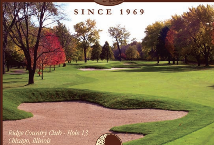
Ridge Country Club - Hole 13 Chicago, Illinois