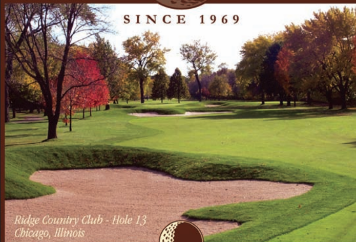
Ridge Country Club - Hole 13 Chicago, Illinois