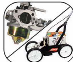
Engine Parts/Marking Tools