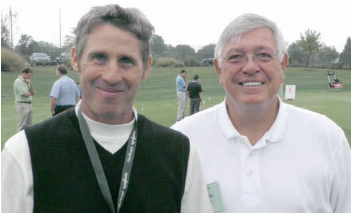
And the winner of the crow's feet contest is...