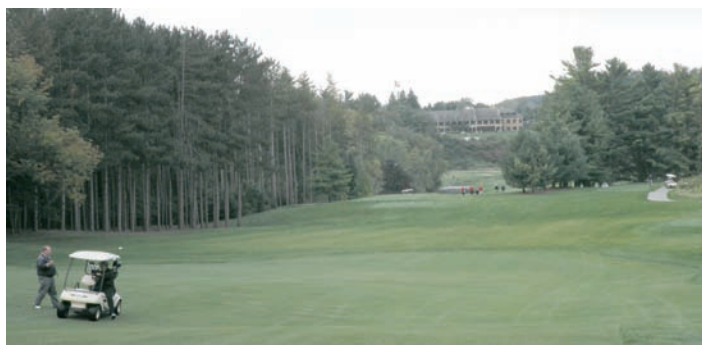
This tells the story of Pine Hills—many pines and even more hills.