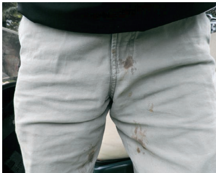
Slight taco bar mishap.