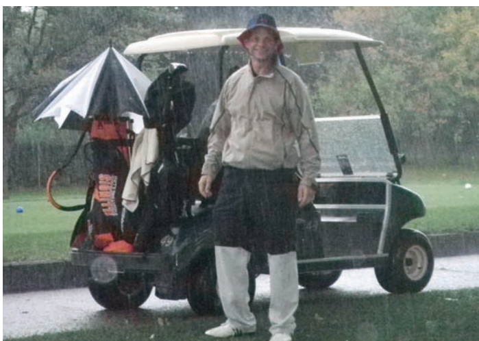
A beautiful day for golf (if you're dressed properly)