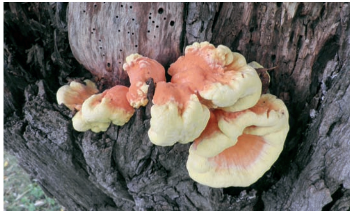
Some very cool fungi...