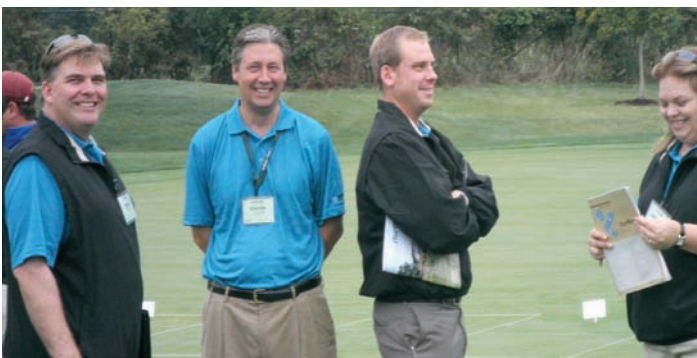
Team BTSI models the black and blue over khaki ensemble—very subtle yet tasteful.