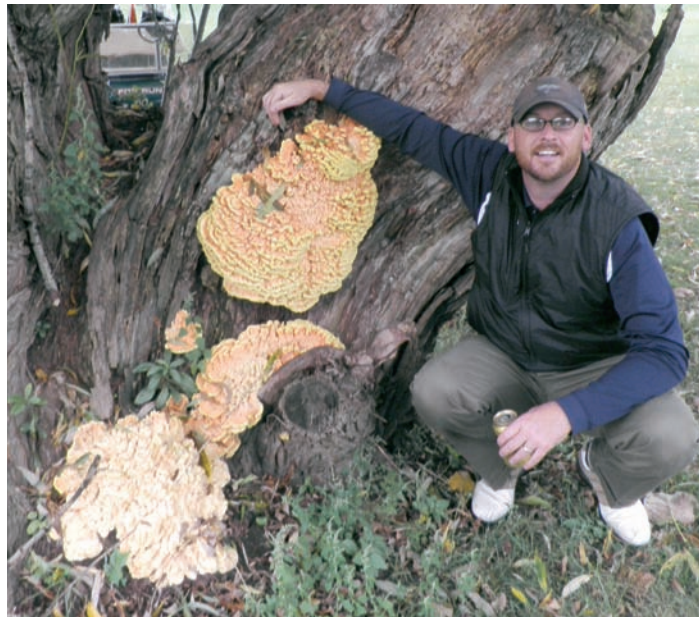
...and a very cool fun guy with the cool fungi.