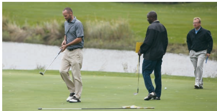
The course took the early rain and fun was had by all who didn't take the golf too seriously.