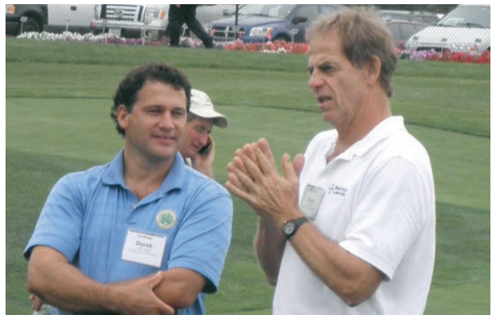
So this fish was like THIS big I tell ya