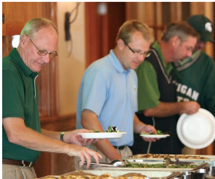
Team Michigan State was represented well in the chow line.