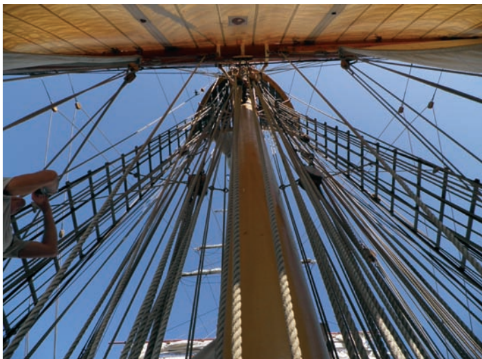
The reason they're called tall ships.

A stressful summer such as the one we've experienced this year would not have been survivable without the ability to get away from work and spend quality time with friends doing something totally non-golf-related. Aside from the usual attractions that the City of Chicago has to offer such as its professional baseball teams (if I may use the word professional), its lakefront, its eclectic dining options, its theater and live music, etc., this summer brought the return of the Tall Ships to beautiful Navy Pier. If you haven't experienced it and have any interest in the history and majesty of these huge sailing ships, a trip downtown should be on your agenda the next time they are here. Just a suggestion.