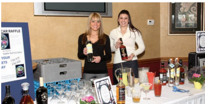
Southern Wine and Spirits (thanks Mike Riesenbeck) helped to remove any bidding apprehensions by serving up Bloody Mary's, Lemon Drops and some delectable scotch.