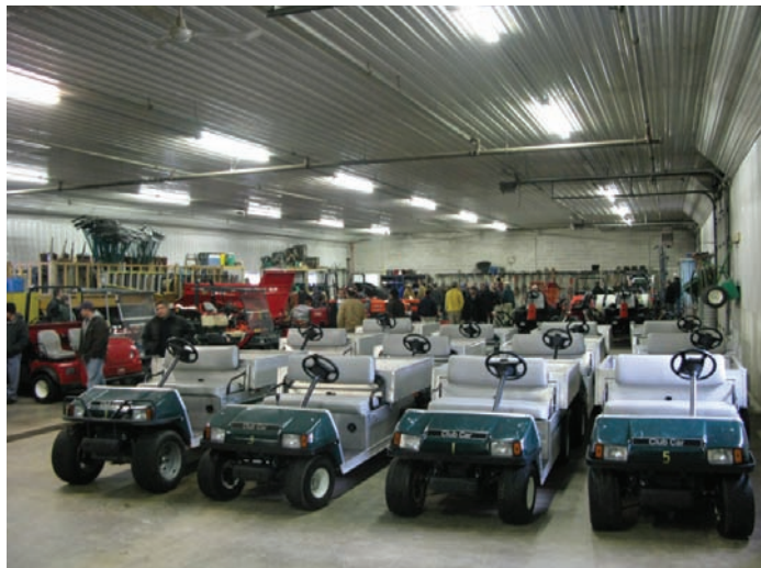
Lake Shore's well lit shop only took one day to clean up before the guests arrived. (above and below)

Our final stop of the day was Lake Shore County Club with our host and lunch provider, Jeff Frentz, CGCS . The Lake Shore facility was large, well lit and heated throughout. There is plenty of room to work as well as ample storage space. Lunch at the end of the tour consisted of mostaccioli, fried, chicken, cole slaw and pizza. There was plenty of food and no one went away hungry. Thank you to our three gracious hosts for cleaning their shops for us, and to everyone in attendance.