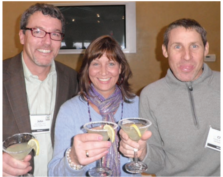
The lemon drops were popular.

Special thanks to our sponsors for the day, who were: John Deere Golf & J.W. Turf, Nadler Golf Car Sales, Inc./Authorized Club Car Distributor, Nels J. Johnson Tree Experts, Inc., and Quali-Pro.