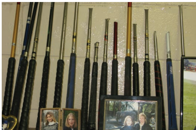
Part of Rick's one of kind collection of broken golf club shafts courtesy of "Da Coach". There were at least three dozen shafts on display bearing Coach Ditka's name.