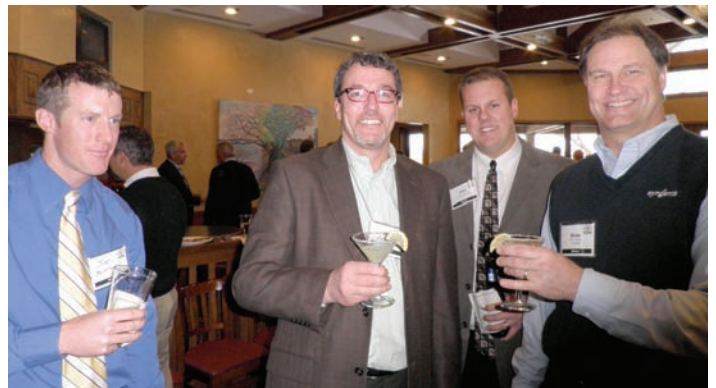
More men with froofy drinks.