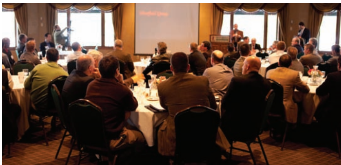
Seven Bridges was the site of the January meeting where over 90 members attended.