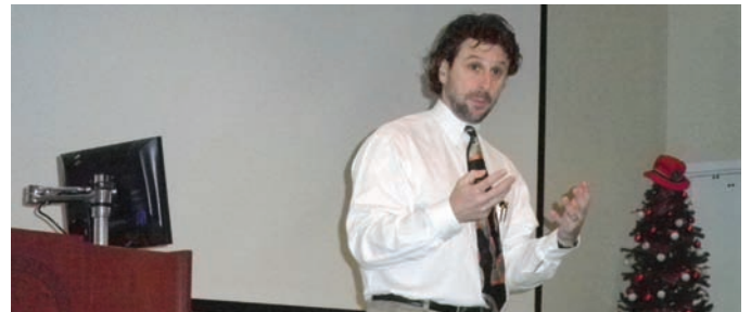
. . . but he eventually was coaxed into taking the podium.