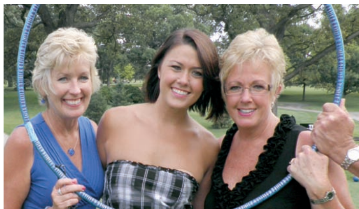
The circle of hula hooping friends.