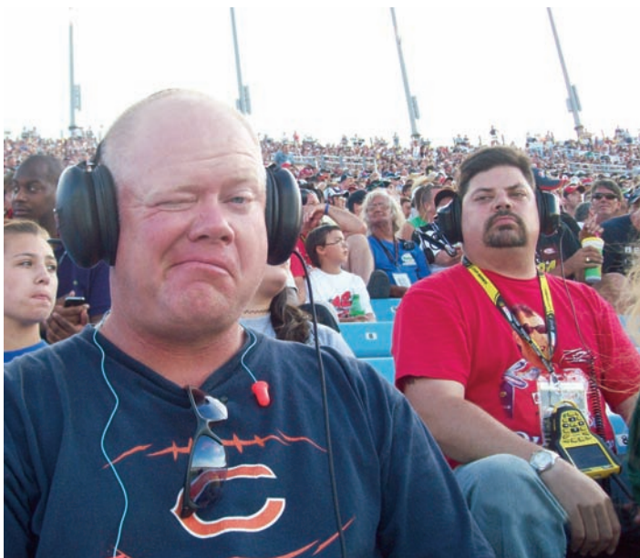
Casting call for the part of Warren in "There's Something About Mary". Neither got the gig.

The 10th Annual John Buck Memorial Golf Outing—already 10!—was held at Crystal Woods Golf Club in Woodstock on the 29th of June. The outing is all about two things—having fun and raising money for scholarships. Beneficiaries of the day's fun and games, besides the participants, are the Kane County Farm Bureau Foundation, the Northwest Illinois GCSA Scholarship Fund and the MAGCS Scholarship Fund. This year's rendition featured everything we've become accustomed to—a great venue, some great people, great food, and great times for everyone. Thank you to everyone involved in making the day grand!