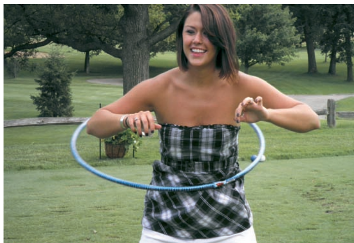
VERY good hula hoop work.

The 10th Annual John Buck Memorial Golf Outing—already 10!—was held at Crystal Woods Golf Club in Woodstock on the 29th of June. The outing is all about two things—having fun and raising money for scholarships. Beneficiaries of the day's fun and games, besides the participants, are the Kane County Farm Bureau Foundation, the Northwest Illinois GCSA Scholarship Fund and the MAGCS Scholarship Fund. This year's rendition featured everything we've become accustomed to—a great venue, some great people, great food, and great times for everyone. Thank you to everyone involved in making the day grand!