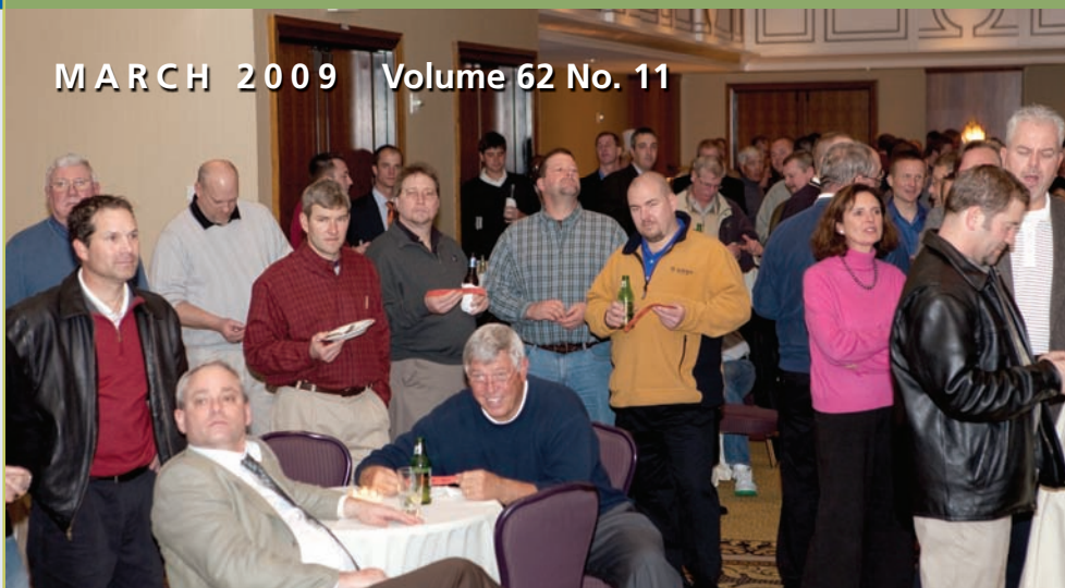
MAGCS members enjoy the local fare at the Hospitality Reception in New Orleans.