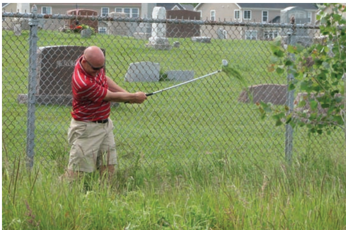
And that cabbage is a golf ball graveyard! Get it? See, there's a graveyard right there...