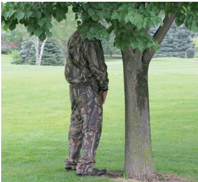
Everyone had trouble seeing this golfer because he forgot his blaze orange cap.