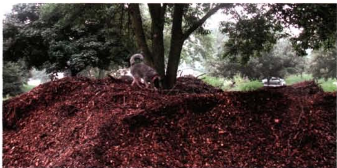
I meant place mulch around the tree not turn the tree into mulch when I said "go mulch the tree on 15."

Other odd August phenomenon involves the general malaise crewmembers suffer after summer's long grind. This can lead to such craziness as ... taking a superintendent's instructions literally and to his very word. This being said, be careful when you tell a new guy to "go mulch the tree on #15"—he just might.