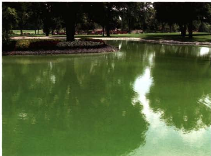
St. Patrick's day in August, a pond trick.

Other odd August phenomenon involves the general malaise crewmembers suffer after summer's long grind. This can lead to such craziness as ... taking a superintendent's instructions literally and to his very word. This being said, be careful when you tell a new guy to "go mulch the tree on #15"—he just might.