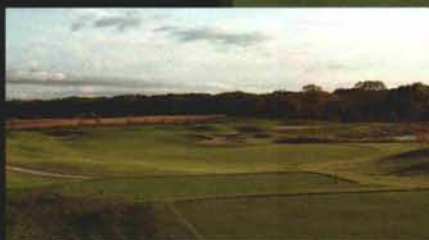
Blackstone Golf Club