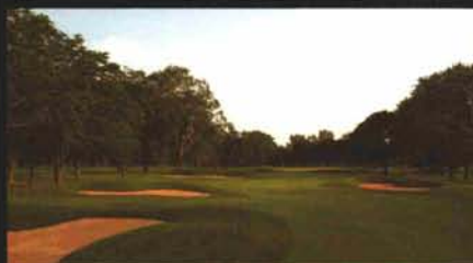
Crystal Lake Country Club

In this game, it's all about perfect execution.