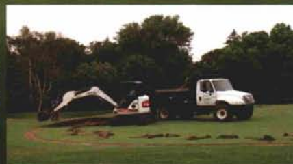
Westmoreland Country Club