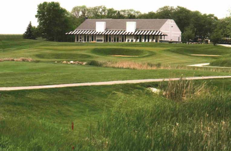
The 18th, "Devils Ditch" at Shepherd's Crook ends on the double false-fronted green.