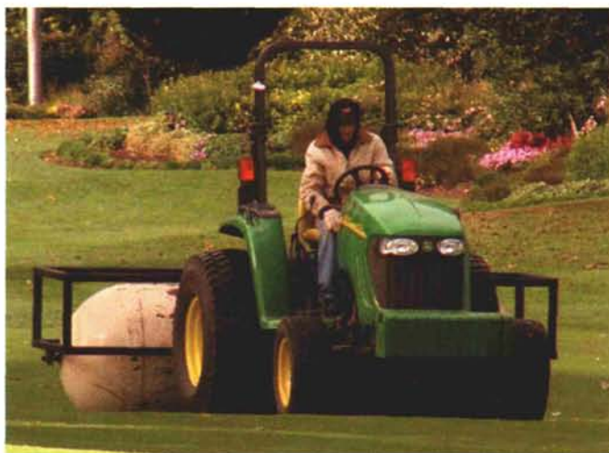
After aerification, fairways are rolled before mowing to prevent scalping.

Finally, as the 2007 golf season comes to an end and we start preparing for next season, take a little time to reflect back on the season. Think about the changes you made this season that worked or didn't work, and start setting new goals for 2008.