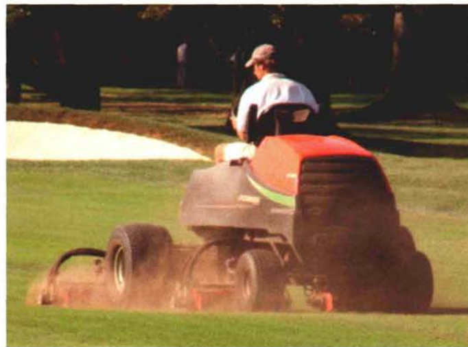
Fairway verticutters are used to clean-up the soil left on the fairways after aerification.