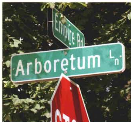
Image 1. The Windings subdivision street entrance.

By now the news is old, but yesterday it wasn't. I attended the initial press conference where state and federal officials announced they had discovered the Emerald Ash Borer (EAB) in Illinois. In fact it was pretty close to my childhood home, just west of St. Charles. The first case was found in a 30 year old subdivision named the Windings. Someone's sense of humor is still working as the main drive is ironically named (Image 1).