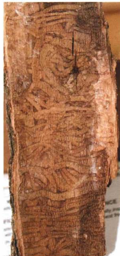
Image 3. Serpentine galleries on inner bark created by feeding EAB larvae.