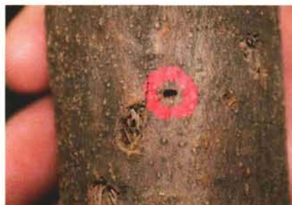
Image 2. The BB sized capital D shaped hole of the EAB