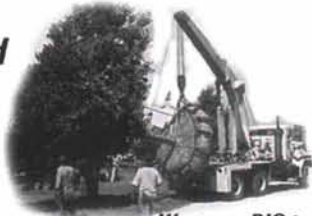
We move BIG trees