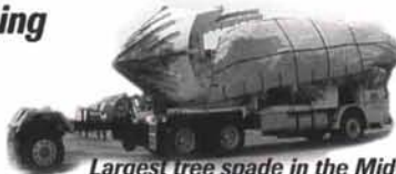
Largest tree spade in the Midwest