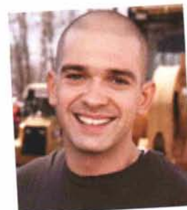
New foreign guy.