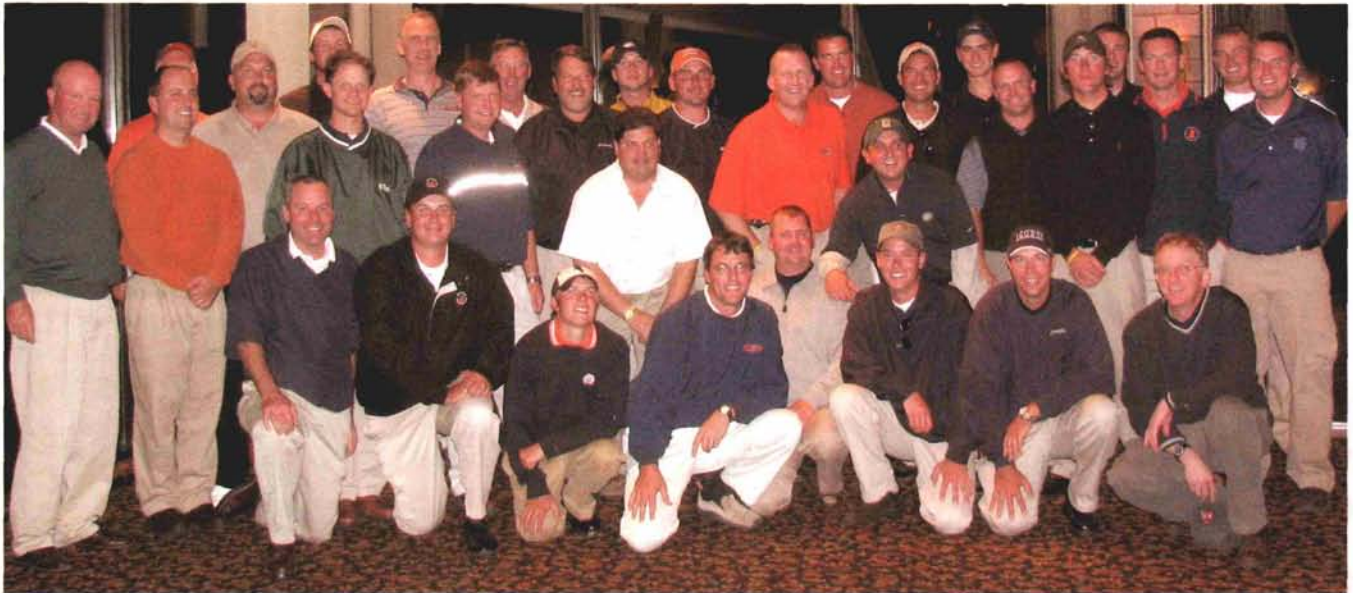
This year's group of U of I alums.