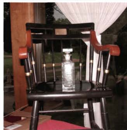
The winner's booty.