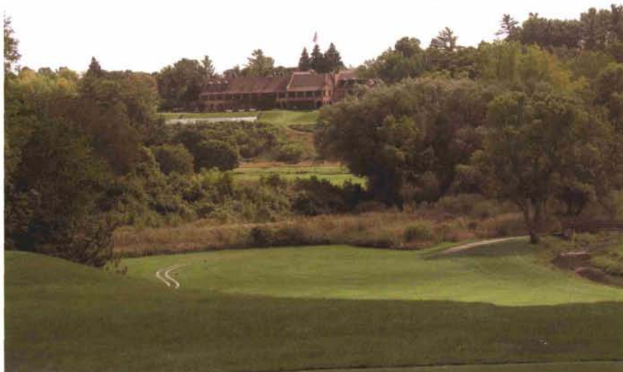
The picturesque clubhouse and rolling terrain of Pine Hills Country Club.