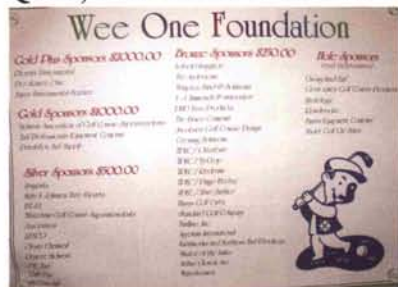
The Wee One Foundation benefactors.