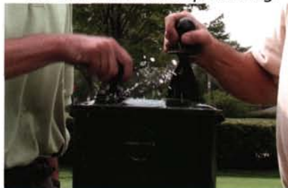
Thank God for the dual ballwashers, without which it would have been a seven-hour round!