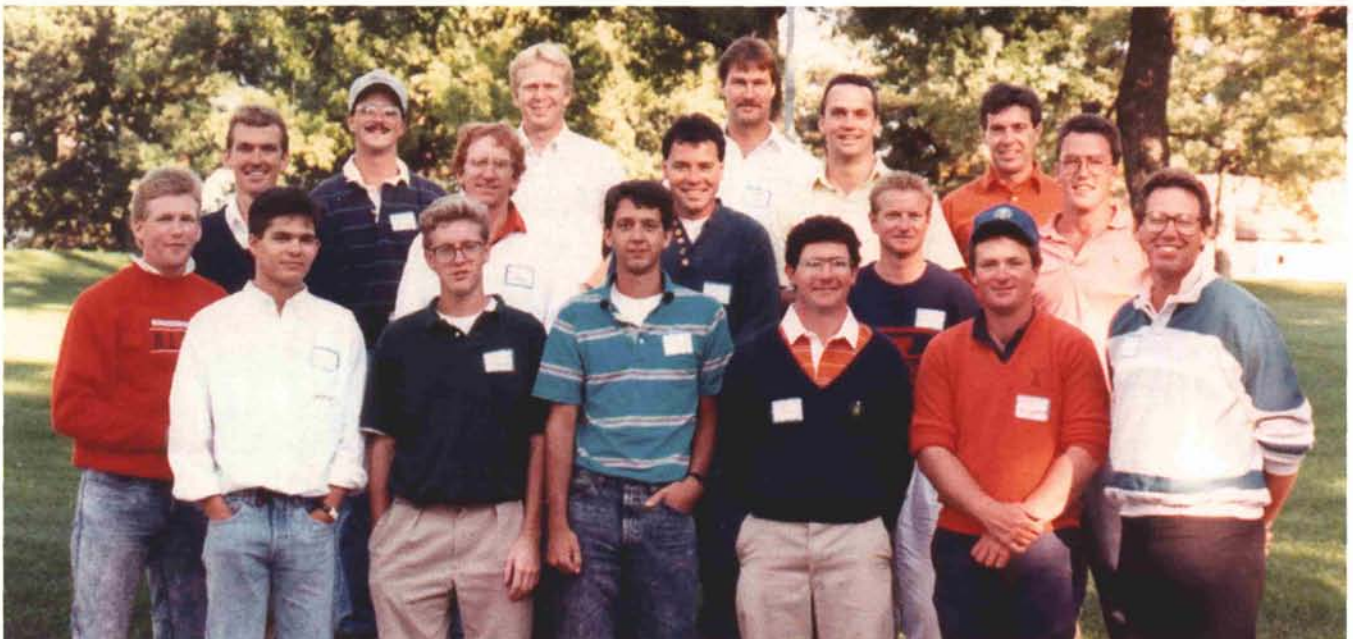
And many of those same people back in 1988 at Bartlett Hills—thinner and less bald.