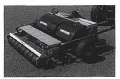
Terra Combi Pin Spiker/Seeder