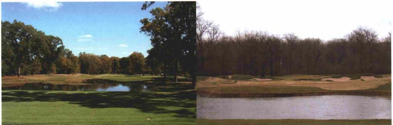
Hole no. 3 at Cantigny Woodside: before and after renovation.