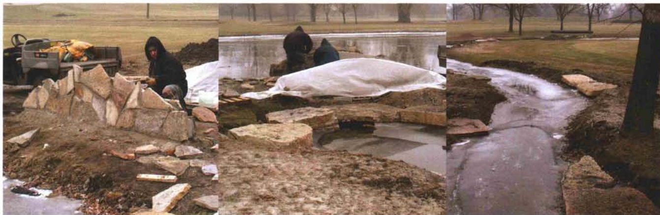
An unsightly drainage ditch undergoes transformation to a meandering creek at Twin Orchard C.C.