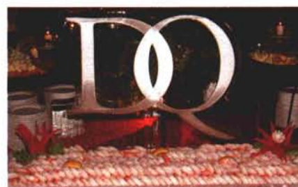
The ice sculpture— stolen from Dairy Queen?