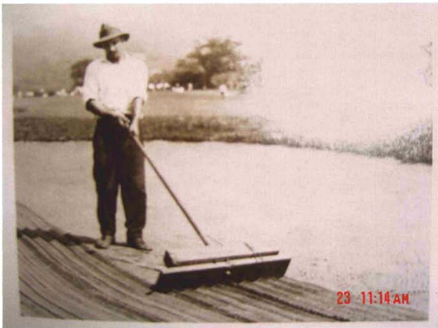
A crew member furrowing the bunker at Oakmont in preparation for the 1925 U.S. Open deemed too penal by Bobby Jones.