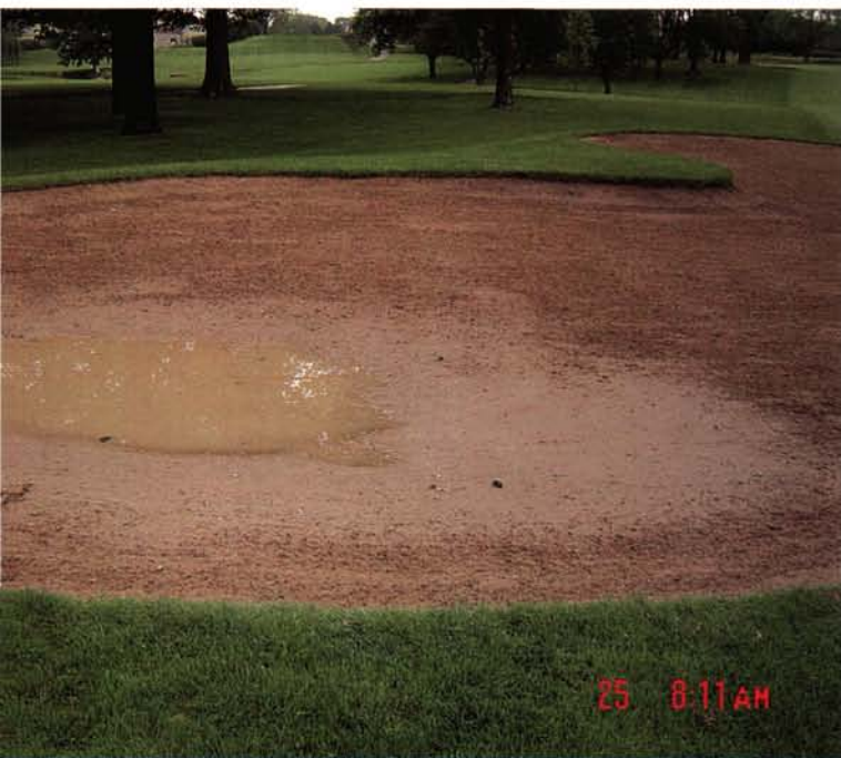
A sand bunker that has inadequate drainage. Notice the different colors of sand from years of contamination.

The consistency and playability of a bunker have become major topics with today's players. Bunkers deteriorate over time with the contamination of native soil from heavy rains, allowing the washouts and fried-egg lies, resulting in poor drainage and the breakdown of sand particles, requiring the constant edging to keep a clean look.