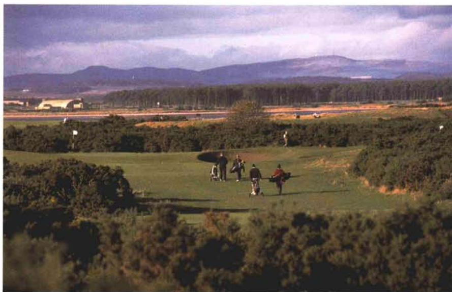
The thick gorse at St. Andrews.

1793, and areas of the course incorporate parts of the original layout, including a meandering burn dating from at least the 1600s and a bridge built of hewn stone 300 years ago by French POWs from the Napoleonic Wars—both features accidentally unearthed by bulldozers during the layout's construction. None of us were too excited about including this "new" course in our itinerary of historic courses, but after lugging our bags through 17 holes of steady rain and constant gale-force winds (the remaining hole providing us with a lovely face-pelting sleet), we were all converts. All 18 holes offered vistas of the North Sea (and in some cases, the North Sea offered an unfortunate resting place for our less-than-inspired shots), incredible changes in elevation, and all the subtle charms of the renowned and revered courses we had played previously. The only difference was that it was the first links course we had played that was routed such that each nine ended up at the clubhouse—a welcome sight on this day, as the time spent between nines was utilized to dry our clothes and