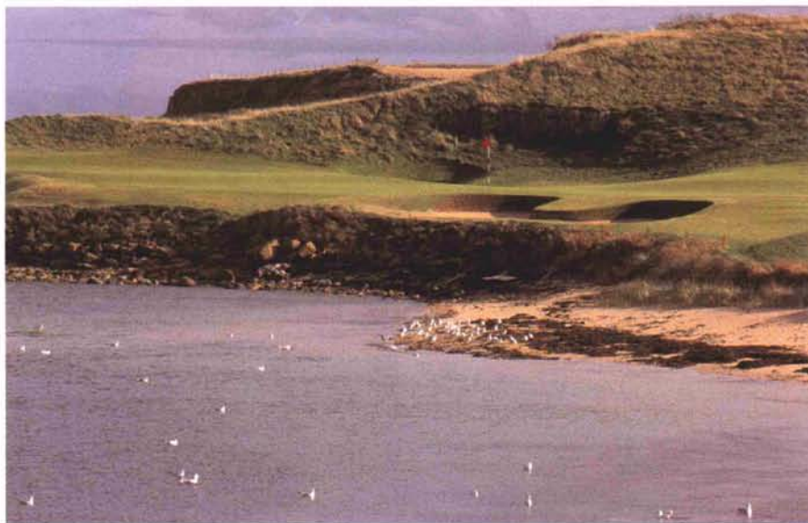
No. 12 at Kingsbarns.