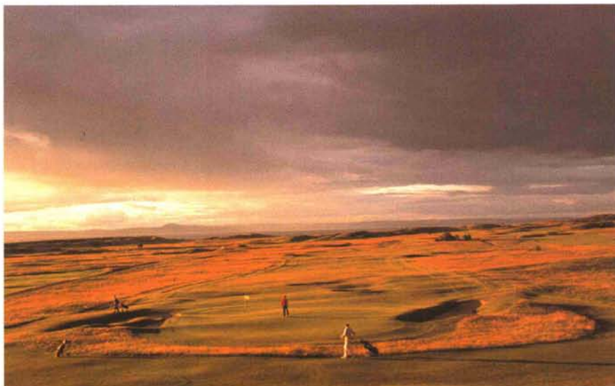
Muirfield at sunset.

inspirational look into the past, and more specifically at how the game we love has been so meticulously preserved in its primordial form for these past centuries in Scotland. It reminded me that, when I look out my office window on a nasty October morning and see a threesome battling wind and sleet, with umbrellas inverted and rainsuits slicked, maybe they are not the idiots I am thinking they are—maybe they are the purists who actually get it. Just maybe they are the rare birds who see golf as a challenge not only against the course, but against the elements as well. Maybe I'll join them next time. The journey was also a bittersweet reminder of what we have done with the game on our side of the world—how we have contrived to change it. Perhaps the differences between golf in Scotland and golf here can be explained by the differences in our cultures and our history—perhaps it is a classic example of an international generation gap. If this is indeed the case, then why wouldn't the game be played differently here than it is over there? Still, upon returning and looking at my golf course, with its rip-rapped pond banks, its razor-sharp bunker edges, its 2≤ rough, its mowing stripes defining every con-