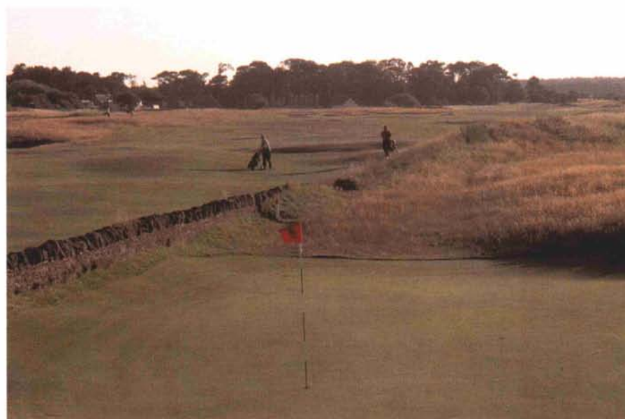
The Pit is the 13th hole at North Berwick.

The Old Tom Morris-designed Muirfield, the Links of the Honourable Company of Edinburgh Golfers, has been situated in its present location in Gullane since it opened in 1891. However, the Company itself is the oldest golf club on record, having been founded in 1744. This group of men wrote the original Thirteen Articles (the first rules of golf), which were adopted 10 years later by the St. Andrews Society of Golfers, later to become the Royal and Ancient Golf Club of St. Andrews. The Company began playing golf on the Leith links outside of Edinburgh, but when it became too populated, they moved down the road to a nine-hole course beside the