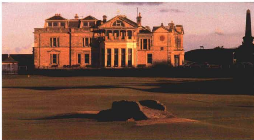
St. Andrews—the Old Course and the old city.