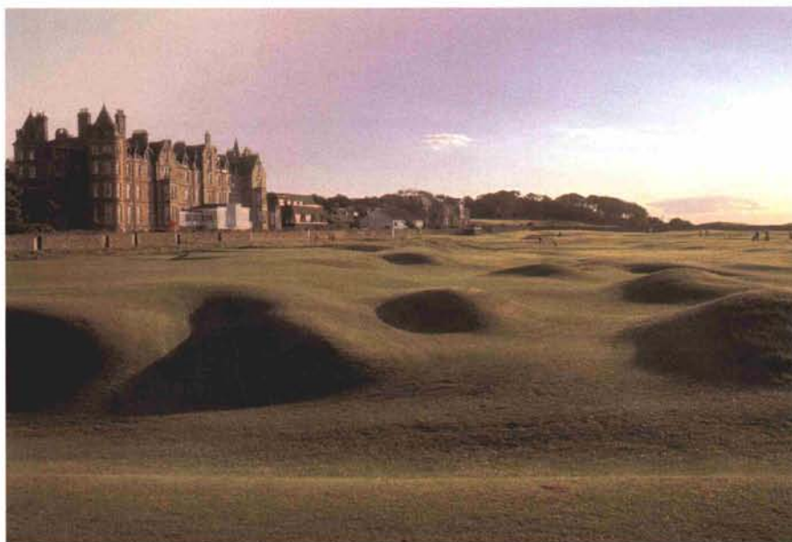
No. 2 at North Berwick.

“Onward, gentlemen!” hollered Murdo, so back into the Ark we went