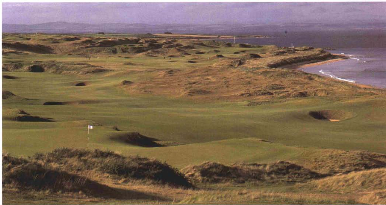
Kingsbarns' front nine and the North Sea.

in to Home, had something memorable and unique. Redan, the 15th hole, is the model by which all similar par 3s are based—the original “redan” hole. The name comes from the Crimean War, when the British captured a Russian-held fort, or in the local dialect, redan . The current Oxford Dictionary defines redan as “fort—a work having two faces forming a salient towards the enemy.” The Pit is another unique golf hole, where