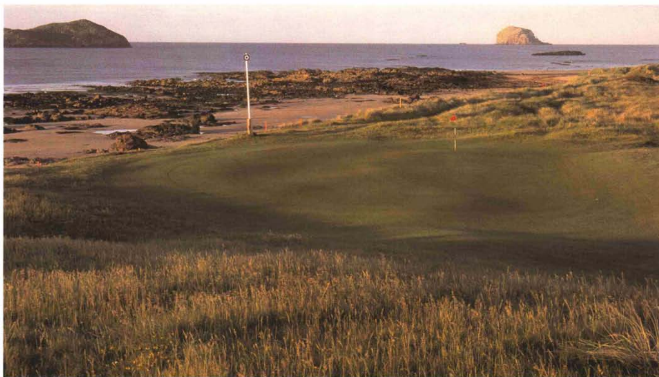
No. 14 at North Berwick—a little long means a lotta trouble.

The long flight home offered the chance to reflect on what we had experienced, and what the “haj” to our profession’s beginnings had meant to each of us as individuals and as golf course superintendents. I can not speak for the others, but for me this experience was, in several respects, an awakening. It was an