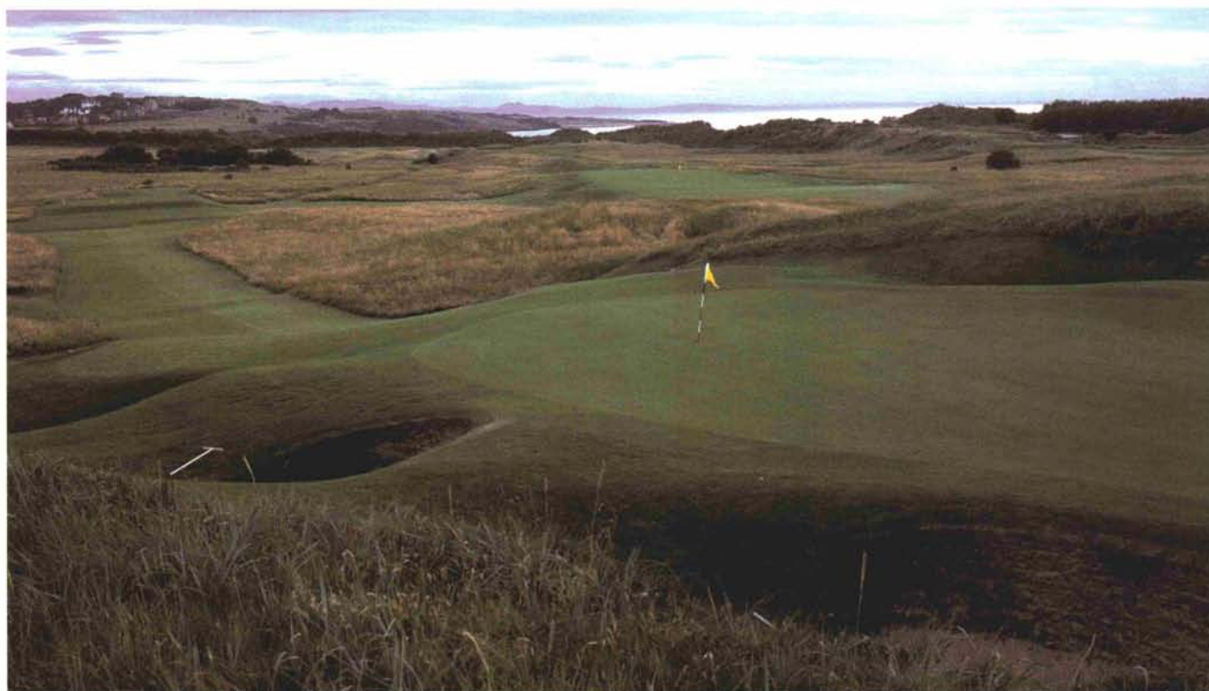
No. 13 at Muirfield.

The author wishes to thank Glyn Satterley, a renowned professional photographer of Scottish golf courses and landscapes, for allowing the use of the stunning golf course images in this article. For information on these and all of Glyn's golf and sporting photography, visit www.glynsatterley.com .