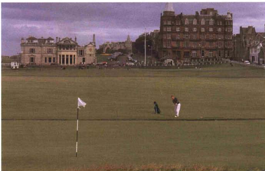
The first hole at St. Andrews.

No course on our tour more than the Old Course exemplified the importance of a good caddie to play guide through the round. Most every hazard is hidden (mainly because the course was originally played in a clockwise direction, then was reversed when Old Tom created a separate green for the first hole); every shot—although offering several different options for a successful outcome—needs the expertise of an experienced sidekick to show the way; and every putt requires both a speed and line, as the greens are sadistically tricky to read. And what a fine lot the Scottish caddies are! They are exactly as you would imagine, caricatures of the grizzled Scotsman, and poster-boys for the anti-smoking advertisements that warn not of the risk of cancer, but of the dangers of premature skin aging and tooth yellowing. Their ability to judge distance by the club needed as opposed to the yardage (especially on the Old Course and at Muirfield, where sprinkler heads are covered with green carpet to conceal them from cameras) is just one example of their talents. Another bonus is their almost uncanny ability to find golf balls in the most difficult of places, from rocky crag to thorny gorse to waist-deep rough. It is a matter of pride for a caddie to have you play the same ball all 18 holes, and if a ball seems hopelessly lost, his compadres will soon be joining him, forming a line as they wade through whatever trouble their employer has