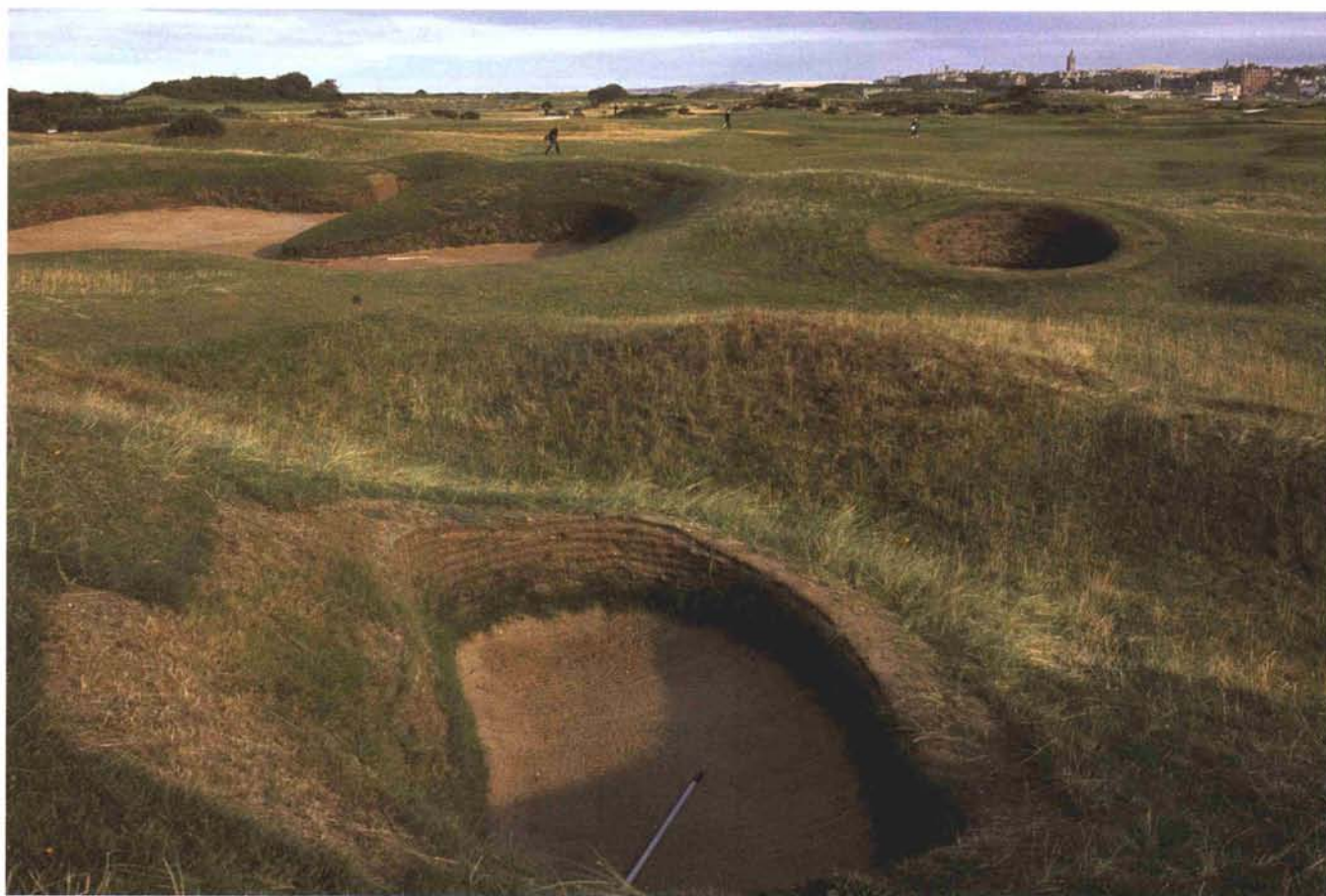
St. Andrews' famous Hell Bunker.