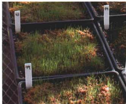
View of greenhouse trial used to estimate viable annual bluegrass in the top 1/2" of soil. Note the tremendous density of annual bluegrass seedlings. The flat pictured was topdressed with the surface 1/2" of soil from an area of less than two-tenths of a square foot.

was confined to the top 0.4". On a seed-number basis, and averaged over all samples containing AB seed, 83% of the viable seed in the whole sample was in the top 0.4" of soil. Another 8.5% was in the second 0.4". More than 90% of the viable AB seed in infested sites is located in the top 0.8" of soil (Figure 1).