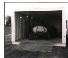
Galvanized ramps make loading and unloading safe

SUPPORT YOUR ADVERTISERS. THEY SUPPORT YOU.