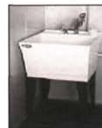
Wash tub with emergency eye-wash