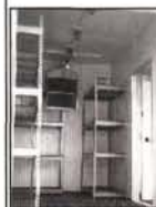
Propane or natural gas heater.