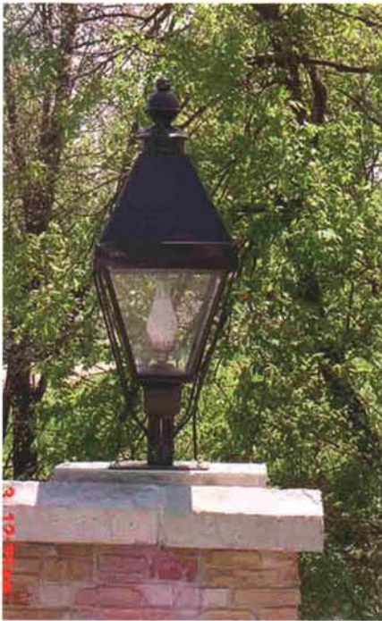
Even fixtures such as these can be installed as low-voltage lights, and it's very simple.

As I mentioned before, I am neither an electrician nor an expert. But through my own experience, I found that using low-voltage lighting is easy and economical. We were able to use low-voltage lighting in our landscape, highlighting the main entrance of our club. It makes our facility feel like home. Remember that first impressions last forever.