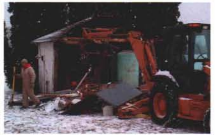
Demolition of old pump station at CGC.

The building permit came through on Friday, February 22, and we contacted ComEd to remove the old electric meter from the building. Demolition of the old building commenced on Monday, February 25, with the disconnection of the electrical service, removal of the electrical meter and dismantling of the electrical panels within the building.