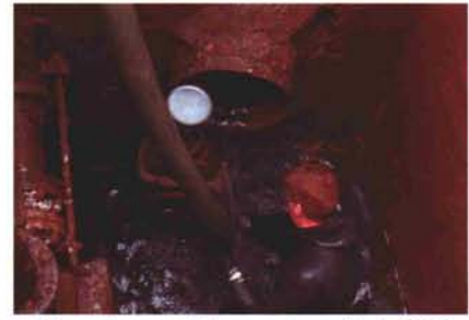
Cleaning out the wet well at CGC.

pressure maintenance pump and two 60-hp pumps are able to provide 1,200 gpm. The water source is a pond fed by two wells. Upon inspection, we found very little silt in the flume and none within the wet well, so water quality was very high, eliminating the need for additional filtering systems.