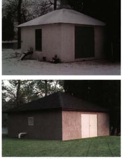
Chicago Golf Club's pump house: before and after.

Proper planning and oversight will result in a new pump station that will provide many years of reliable service.