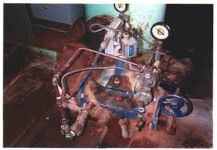
Inside CGC's old pump station.

After studying our system in detail, the consultant made a number of recommendations. One of them included replacing the pump station. As was the case with Shoreacres, a primary concern was the integrity of the hydro-pneumatic tank. The pressurized tank displayed sections of rust and deterioration that could potentially result in the tank rupturing and injuring people in the building.