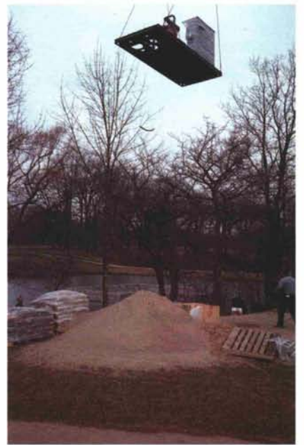
Lifting pump station into pump building at Shoreacres.

The timeframe for construction at Chicago Golf Club was set for the colder winter months of January and February 2002. The irrigation pump station area has no road access, in fact, the nearest paved area is more than 1,800 feet away. Frozen ground was imperative for the heavy equipment to