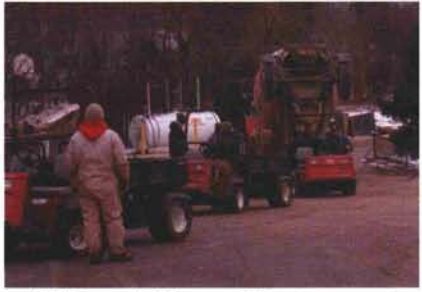
Utility vehicles used to transport cement at CGC.

On Tuesday, February 26, tear-down of the building began. Footings for the new building were poured on Thursday, February 28. At this point, the ground had become soft. We set plywood across the fairways and utility vehicles were used to transport the cement for the footings from the trucks.