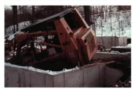
Even with the best planning, "things will go wrong," as this episode at Shoreacres testifies.

erty and who will be responsible for them. Things will go wrong during any project of this magnitude.