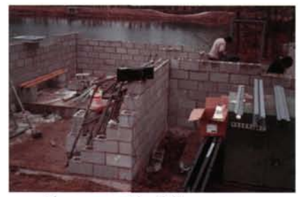
Shoreacres' building goes up around existing transformer.

The building at Shoreacres, meanwhile, is very elaborate. Measuring 24' x 24' less an 8^{-1/2} ' x 8^{-1/2} ' section to accommodate the electrical transformer, the total area for the building is 504 square feet. The cost and difficulty of relocating the transformer called for the building to surround the existing transformer.