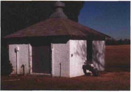
Chicago Golf Club's old pump house.

cal components and wires littered the walls, making diagnostic tasks for system failures a nightmare. No components were clearly marked and old wires were intertwined with replacement wire. The interior was lit by one 100-watt light bulb in the center of the structure. A flashlight was almost always required for any type of inspection.