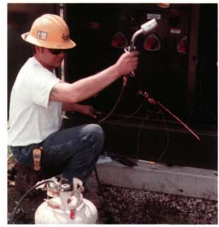
Working on the transformer at CGC.

The most important element of planning for a pump-station installation is making sure all of your permits are in order, well in advance. Contact the utility company and research your existing service and what will be required of the future station. If a transformer change-out or wire connection needs to be made, it may be up to 12 weeks before it will happen.