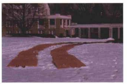
Plywood path for cement trucks to traverse to minimize golf course damage.