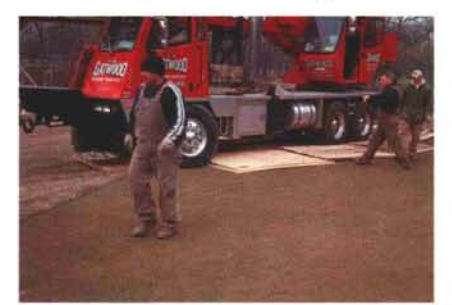
Crane on no. 18 at Shoreacres.

A flagged pathway was set in the rough for trucks to follow, creating a haul road to the construction site. The road area incurred very little damage; most of it could be repaired with a roller. The exception was at the area surrounding the pump house, where most of the turning occurred with equipment. Plywood came into use in some areas when necessary; for example, a crane sitting on no. 18 tee lifted the pumps off the truck down a ravine and into the building.