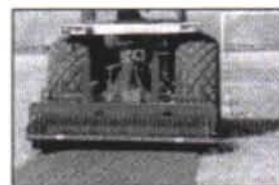
ROTADAIRON SOIL RENOVATOR