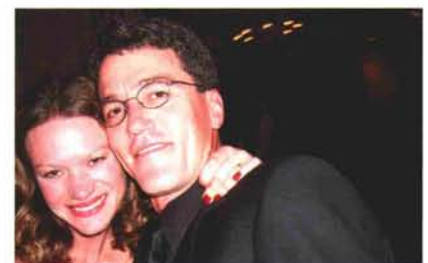
The Gurkes shoulda gotta room . . .