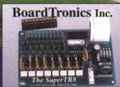
CONTROLLER BOARD REPAIRS