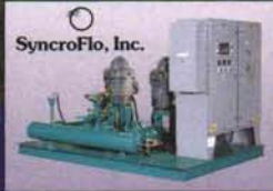
SYNCROFLO EAGLE PUMPS