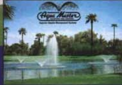
AQUA MASTER FOUNTAINS