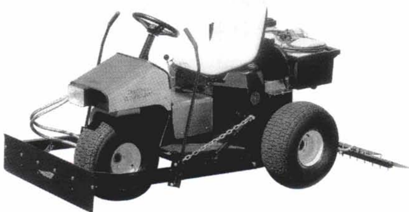
DIAMOND TRIKUT 5000 Riding Greens Mower

➔ Reliability — Every product is backed by a two year bumper-to-bumper warranty. Diamond's exclusive Five-Star Service Program is designed to keep you up and running.