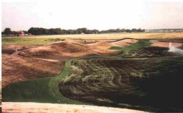
8/9/93—Hole #5 (Left Fairway) – Day 5 – First seedlings emerge.