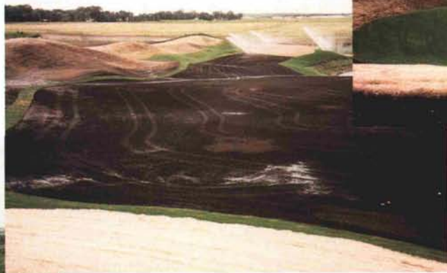
8/5/93—Hole #5 (Left Fairway) – Day 1 – Seeding complete.