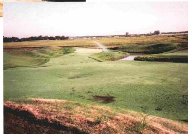
8/20/93—Hole #5 (Left Fairway) – Day 14 – Two-week-old seedlings.

At no time can young seedlings go without proper and timely irrigation, nutrition and conditioning. Grow-in accomplishment is governed by how one manages the open end of a hose. Providing water at the right time, in the right amount, at the right frequency is the deciding act.