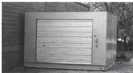
St. Charles Park District Golf Course 14' wide x 17'6" long Housed Rinsate Station

Heavy gauge all steel construction requiring only standard routine maintenance provides you with years of virtually trouble free use.