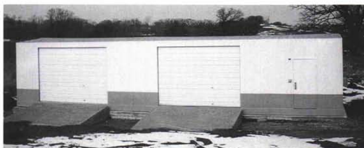
Oak Grove Country Club, Harvard IL 14' wide x 50' long Combination