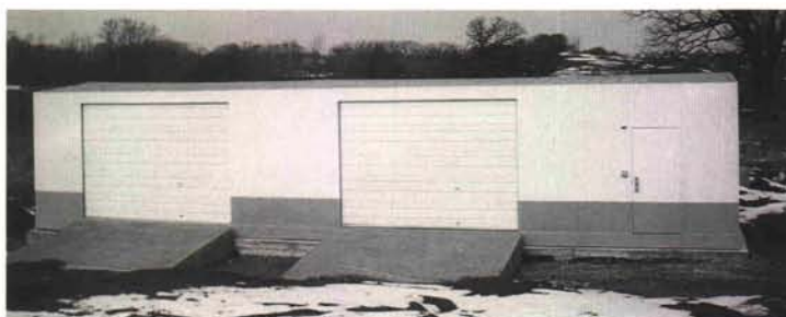
Oak Grove Country Club, Harvard Il 14' wide x 50' long Combination