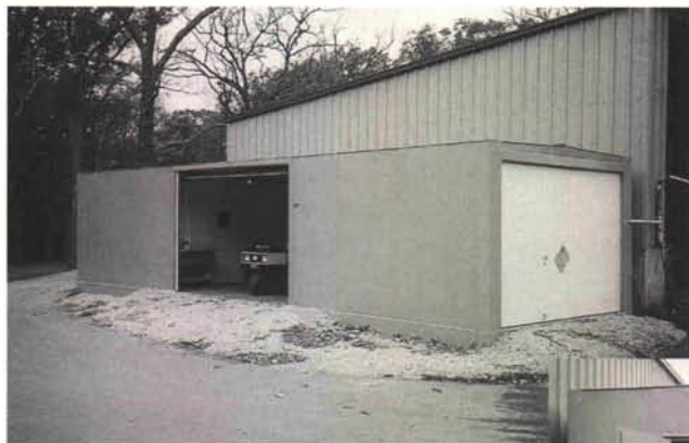
14' wide x 40' long Combination Unit Oak Brook Golf Course, Oak Brook Illinois