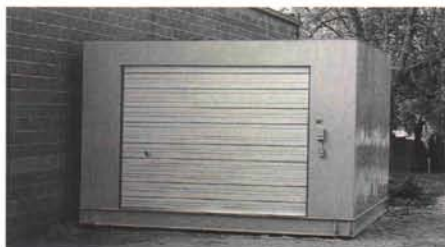
St. Charles Park District Golf Course 14' wide x 17'6" long Housed Rinsate Station