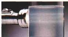
This should shed some light on the subject. Our active ingredient is less than 0.1 micron in size while other sterol inhibitors are about 25 microns in size.

Simply put, Banner MAXX is the best tank-mix partner. It has the same properties as water. It won't clog filters and has no odor. And unlike