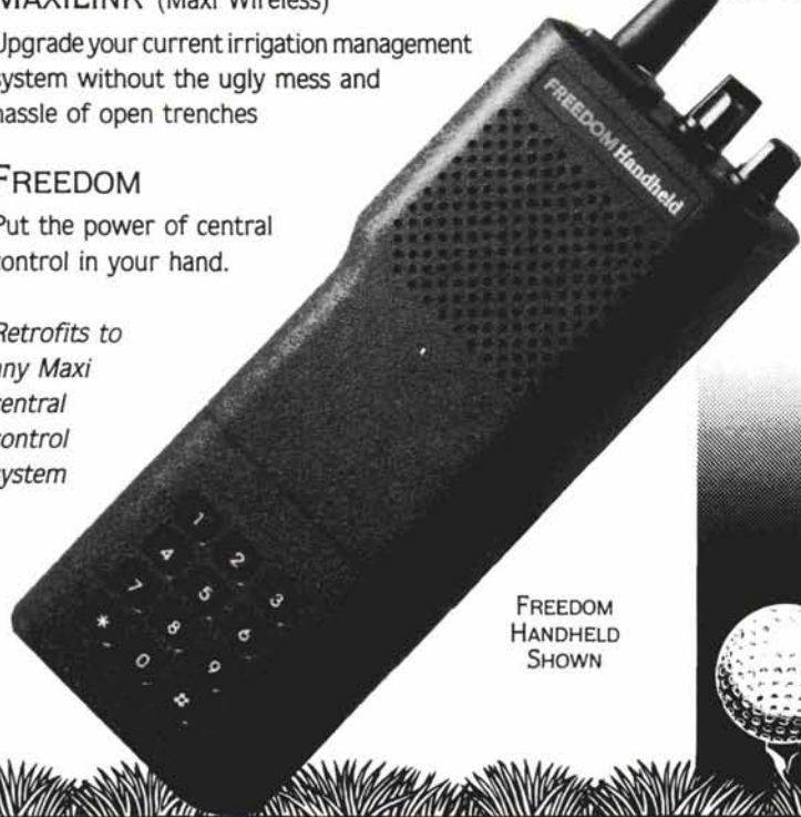
FREEDOM HANDHELD SHOWN

Retrofits to any Maxi central control system