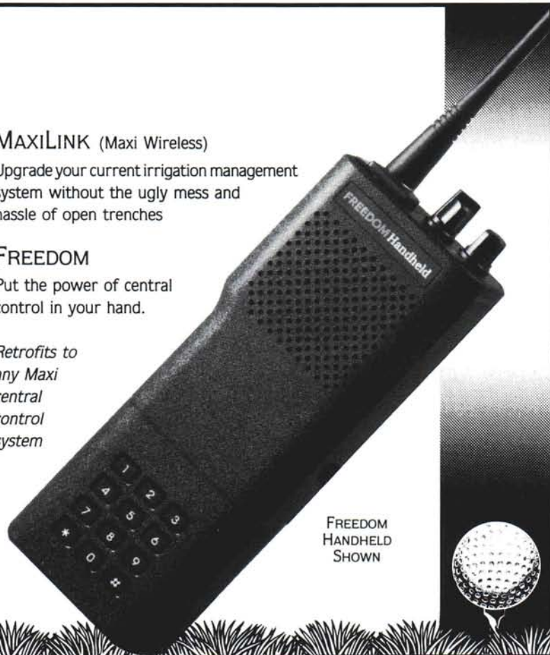
FREEDOM HANDHELD SHOWN

Retrofits to any Maxi central control system