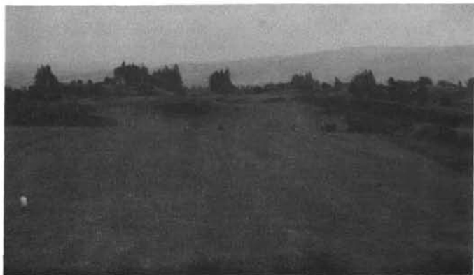
Gleneagles Golf Club

They did a lot of sightseeing, staying at "Bed & Board" and drove almost 1,000 miles. The countryside in Scotland was beautiful and they are ready to return again. Below are some of the pictures of the trip.