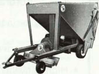
MODEL 888-898 — 1010 & 1495 Trail Vacs

These models are ideal for loading leaves or other debris into a truck. They feature either a 10 or 14 H.P. engine. A 10 inch pick up hose is standard and other accessories are offered.