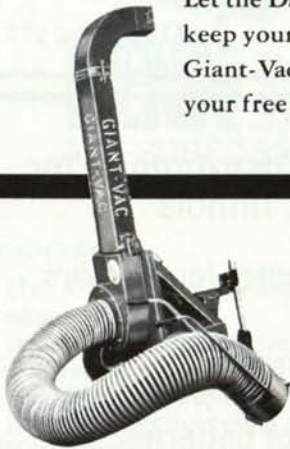
Truck Loader - MODEL 1001-C and 1401-C

Especially for clearing Fall fairway leaves. Let the Davis Company show you how to keep your fairways in play all the time with Giant-Vac double headed blowers. Call for your free demonstration, today.