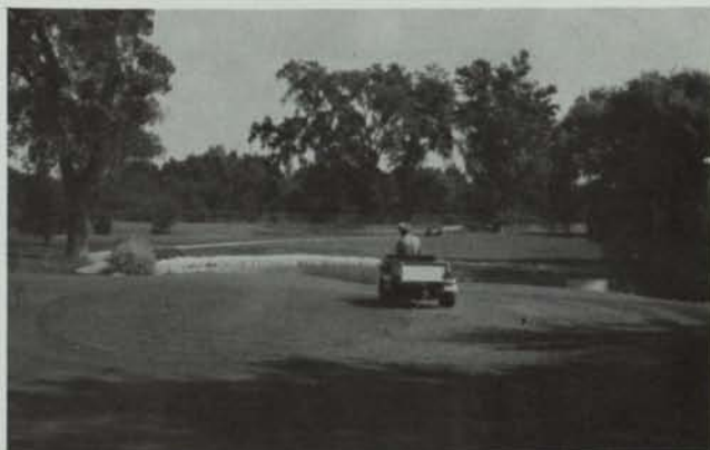
No hand pulling of the drag mat