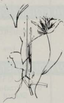
Small Pondweed Potamogeton pusillus