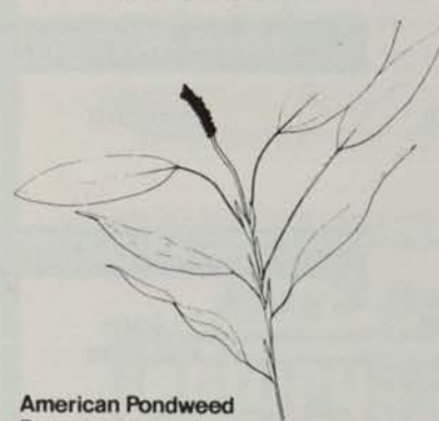
American Pondweed Potamogeton nodosus (formerly Potamogeton americanus)