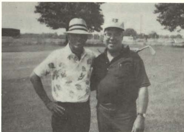
Chi Chi Rodriguez