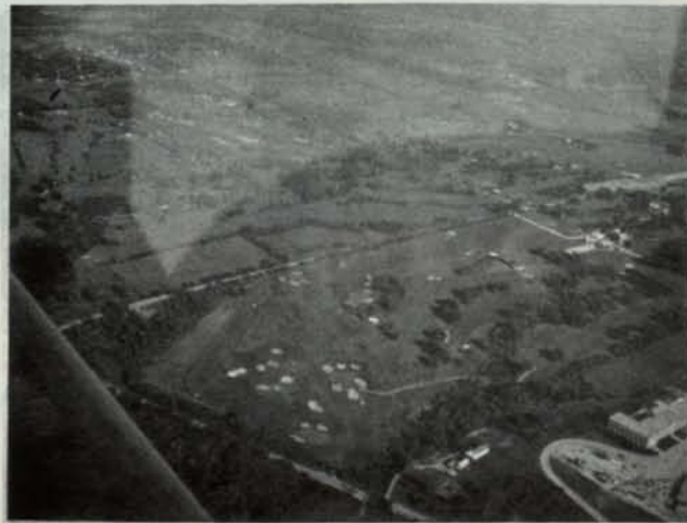
4. This is only part of it. The traps are a give-away. If they aren't, the size should be.