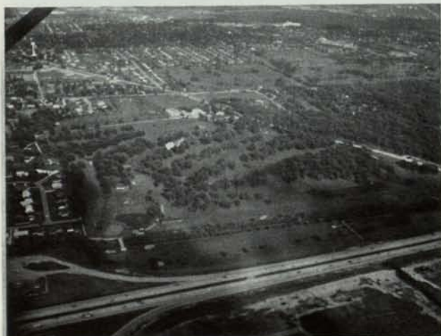
3. Near a tri-state oasis, need I say more.