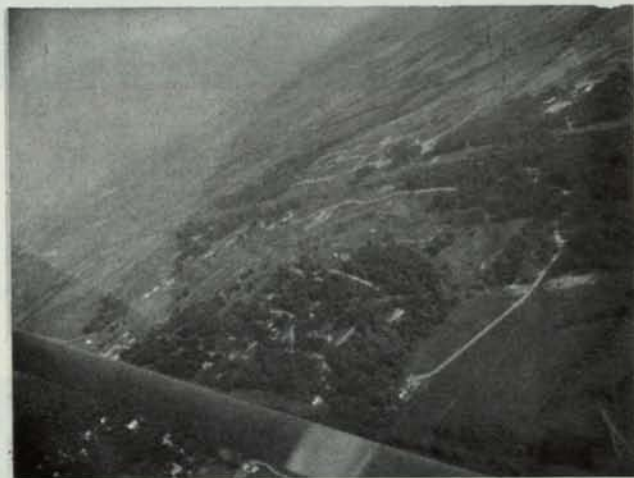
2. Long and narrow. A waterman's dream. Notice how open the country is when you get this far southwest.