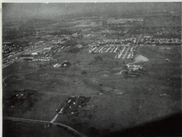
1. This treeless wonder is straight west of the loop. Notice the pond in the center.

Now for a warm up. The four pictures below are trials. Answers are on the next page.