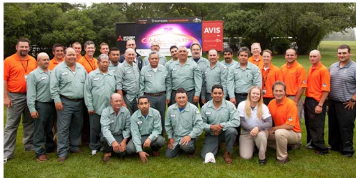
The crew in green and the volunteers in orange. The orange made it easier to keep track of them and himself.