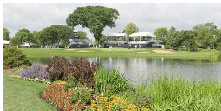
Each day of the tournament brought a new set of conditions that the staff dealt with successfully.